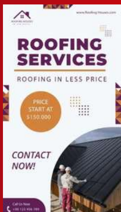
Image Ads We Can Create For Vending Operators